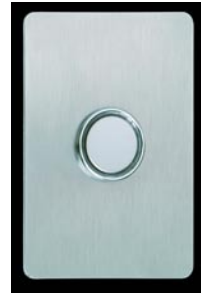
Figure 2 Hall Call Station

Hall Call Stations are installed at all landings to move the cab to the landing from which it is being called. An optional key switch limits the elevator's use to authorized persons only.